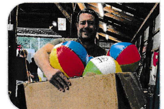
Had a great time at the Newton County Fair, seeing old friends and making new ones!