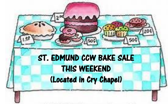
ST. EDMUND CCW BAKE SALE THIS WEEKEND (Located in Cry Chapel)